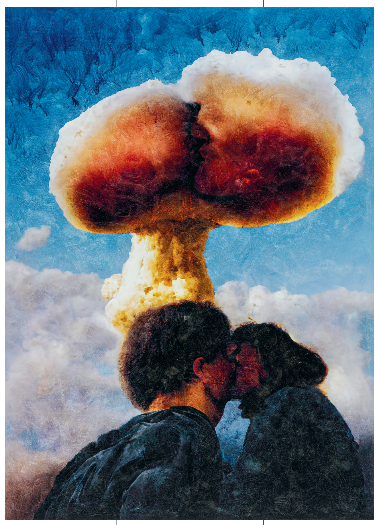
アルマゆネ・14~マソマナ、(NUCLEAR KISS) 2022 Inkjet print and acrylic on canvas, 187 × 135 cm

— In the early days of the web there was excitement at democratizing possibilities of the net. There was this idea that information was going to be free, and everybody was going to be able to have access to all the world's knowledge.