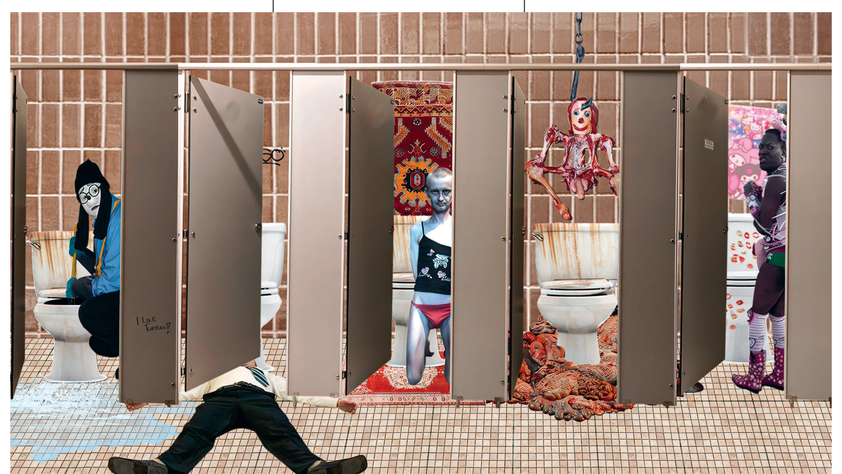
Above: COUNTERFEIT POAST (still), 2022, 4K stereo video, 28 mins Below: PUNCTURED SKY (still), 2021, 4K video and sound, 21 mins

As the tech monopolies took more and more control of the internet, everything became filtered through specific algorithms and streams. Nowadays, everything is filtered through Twitter, TikTok, Instagram, and Facebook.