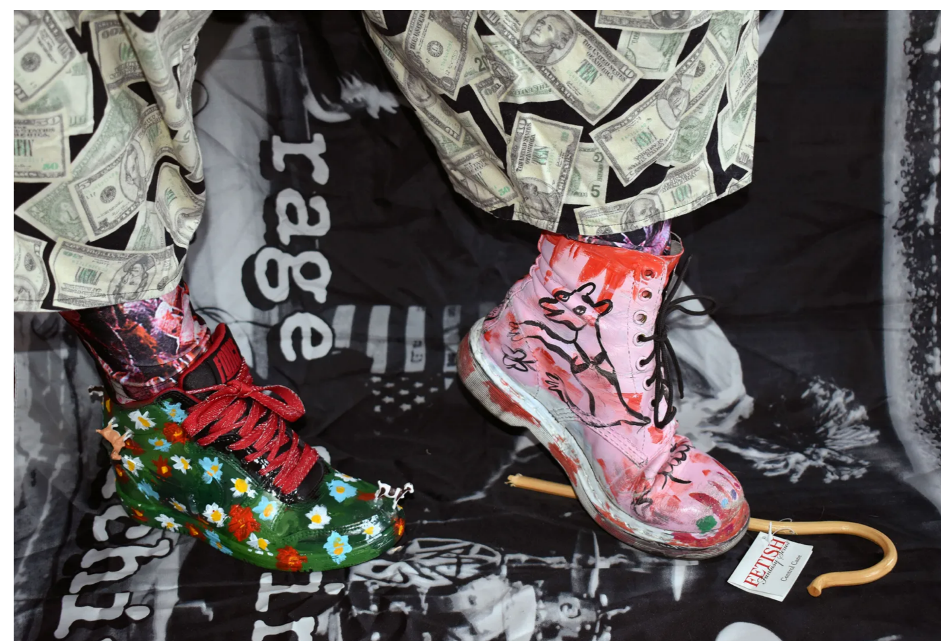
Crash the Control Cane.