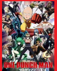
One Punch Man

A cute sculpture at a cute group show curated by Lolita in Paris. I was very happy to discover it.